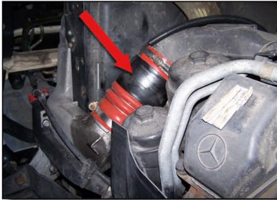
Pre-fabricated charge air hose manufactured with a coil system, replaced Mercedes Benz Part-No. A 003 094 08 82

tenance-free, no trimming/adjustment is necessary. We offer 3 years of guarantee on the equipment and its function.