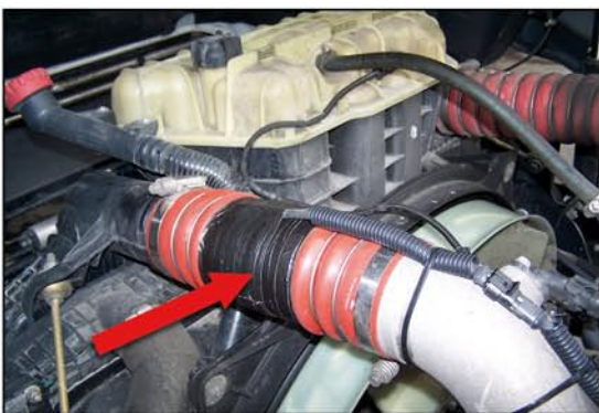
Pre-fabricated charge air hose manufactured with a coil system, replaced MAN-Part-No. 81.96.301.0900

The Air-Tec-System was tested by TÜV-Süd according to ECE 83.05 and ECE 101 Emission- and Consumption Test. During this test procedure a passenger car is under load driven on rolls and the exhaust volume is determined. A modern CDI Diesel of pollutant class Euro 3 was measured a reduction of CO output by 51 %, unburned hydrocarbons by 38 % and reduction of soot output by 26 %.