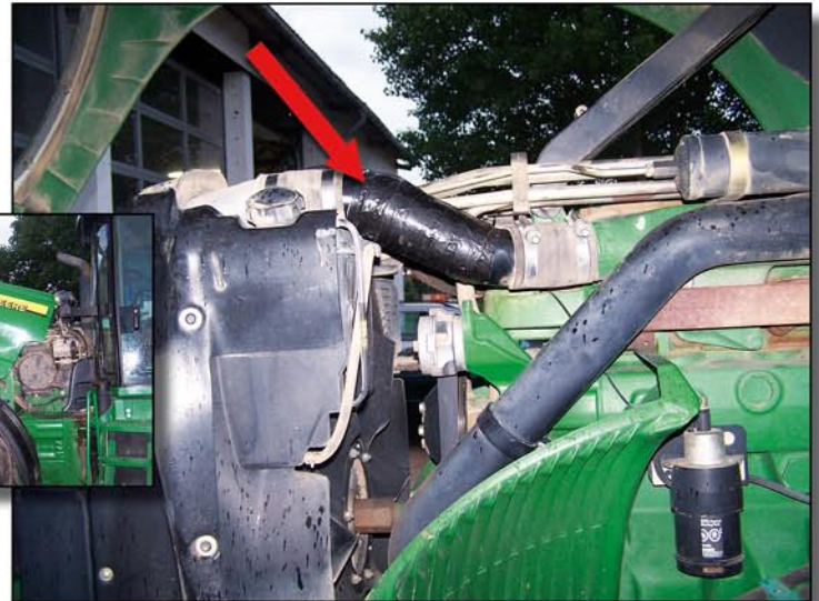
Example of a coil assembly on the charge air hose John Deere 8420

The structure of the Air-Tec-System is very simple. Each combustion engine powered by Diesel, petrol or gas may be re-tooled without any problem.