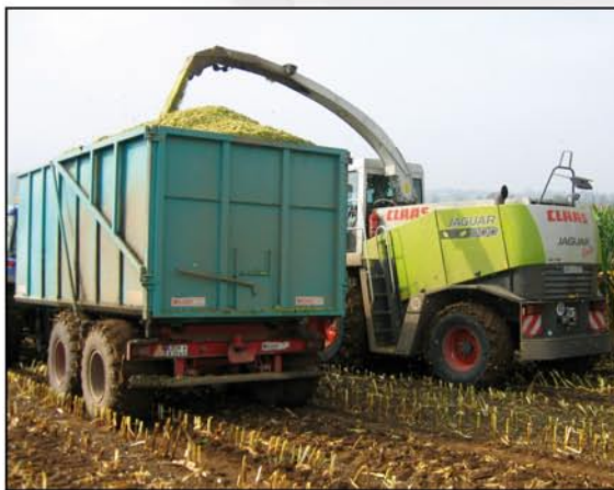
Example of a coil winding on the air intake