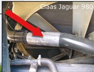
Claas Jaguar 980