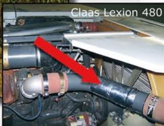
Claas Lexion 480

An electric coil is placed on the air intake/air hose without changing the original air intake system of the manufacturer. By installation of an electronic module in the size of a cigarette box in a protected spot in the vehicle, the electric coil is supplied with power.